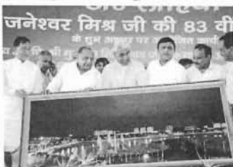
Samajwadi Party chief Maylaram Singh Yadav with Uttar Pradesh Chief Minister Akhilesh Yadav during the Janshwar Mishra birth anniversary programme in Lucknow on Wednesday.